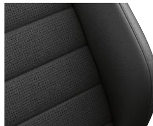
"Vienna" leather* Titan Black (TW) Standard on e-Golf Executive Edition