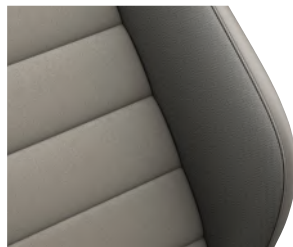
"Vienna" leather* Shetland/Shetland XW Standard on e-Golf Executive Edition