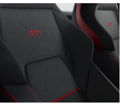
'ArtVelours' fabric Soul- Tornado Red (UG) Standard on GTI Clubsport 45