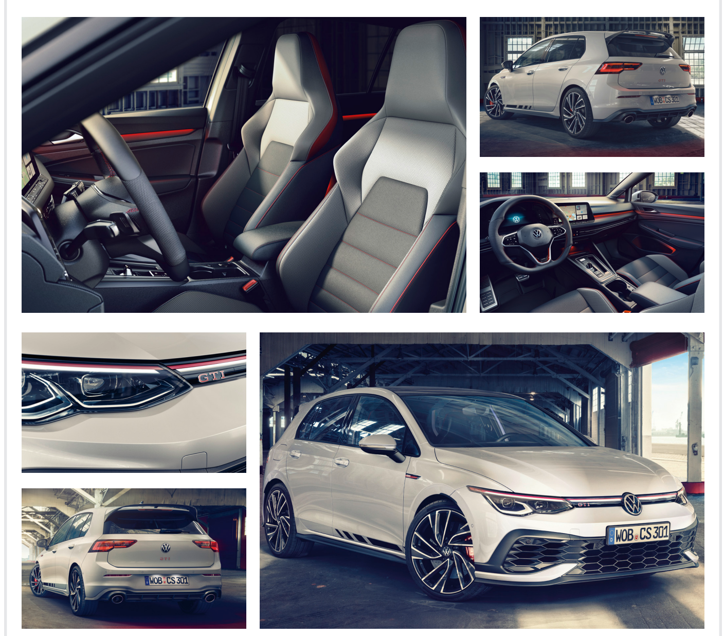
Note: The above image shows optional "Adelaide" 19" alloy wheels and Vienna Leather Package