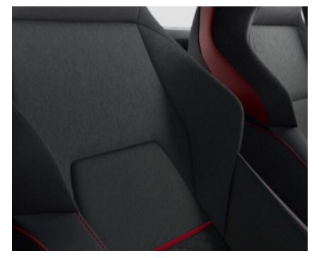
'ArtVelours' fabric Soul- Tornado Red (UG) Standard on GTI Clubsport