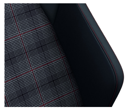
'Scale Paper' fabric Soul- Tornado Red (UG) Standard on GTI