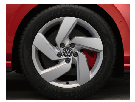
STANDARD ON GTE 17" 'Richmond' alloy wheels 7J x 17 Tyres: 225/45 R17