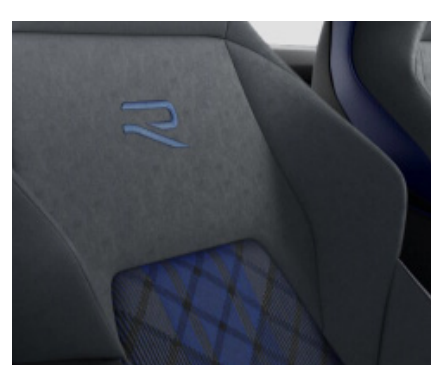
'Sardegna' and 'ArtVelours' fabric Soul - Blue/Black (OB) Standard on R