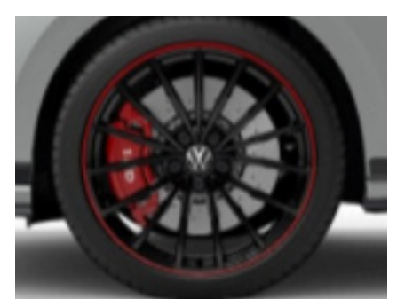
STANDARD ON CLUBSPORT 45 19" 'Scottsdale' alloy wheels 7.5J x 18 Tyres: 225/40 R18