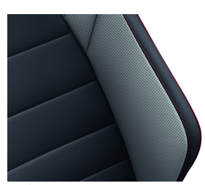
'Vienna' leather Soul- Tornado Red (UG) Optional on GTI