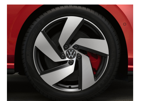
STANDARD ON GTI & GTI CLUBSPORT 18" 'Richmond' alloy wheels 7.5J x 18 Tyres: 225/40 R18

The addition of optional extras may result in the vehicle increasing in Co2 g/km and therefore, attracting a higher rate of VRT than described in this product guide. For your exact configuration value, both Co2 g/km and RRP, please visit volkswagen.ie configurator.