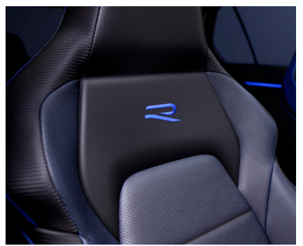
'Nappa' Carbon leather Soul - Blue/Black (OB) Optional on R