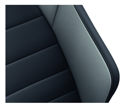
'Vienna' leather Soul- Crystal Grey (UN) Optional on GTD & GTE