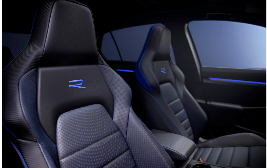
Note: The above images show optional Golf R Performance Package, Nappa Leather Carbon Package and Akrapovič Titanium Exhaust System