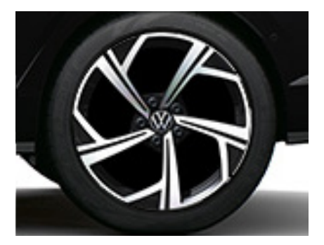
STANDARD ON R 18" 'Jerez' alloy wheels 7.5J x 18 Tyres: 225/40 R18