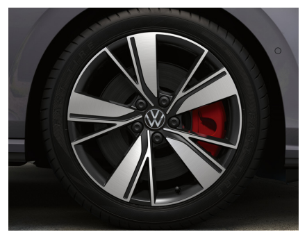
STANDARD ON GTD OPTIONAL ON GTE 18" 'Bakersfield' alloy wheels 7.5J x 18 Tyres: 225/40 R18