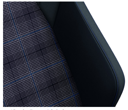
'Scale Paper' fabric Soul- Motion Blue (UP) Standard on GTE