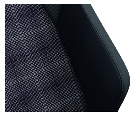
'Scale Paper' fabric Soul- Crystal Grey (UN) Standard on GTD