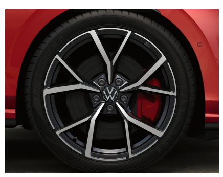
OPTIONAL ON GTI, GTI CLUBSPORT, R & GTD 19" 'Estoril' alloy wheels 8J x 19 Tyres: 235/35 R18