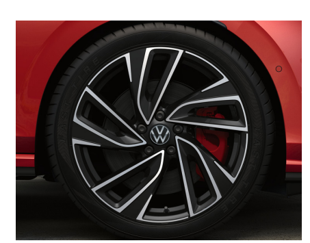
OPTIONAL ON GTI, GTI CLUBSPORT, R & GTD 19" 'Adelaide' alloy wheels 8J x 19 Tyres: 235/35 R18