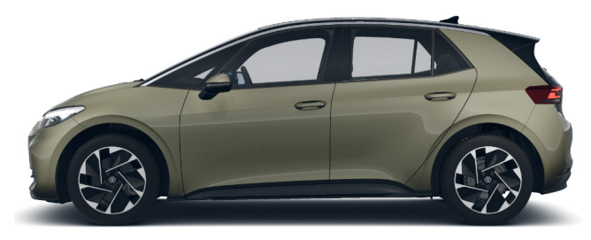
Dark Olivine Green Metallic**