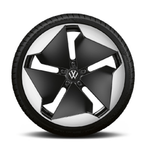
STANDARD ON ID.3 Pro S Plus 20" 'Sanya' alloy wheels 7.5J x 20 Tyres: 215/45 R20