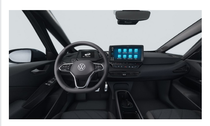
Standard on ID.3 Pro Soul stitching Crystalgrey