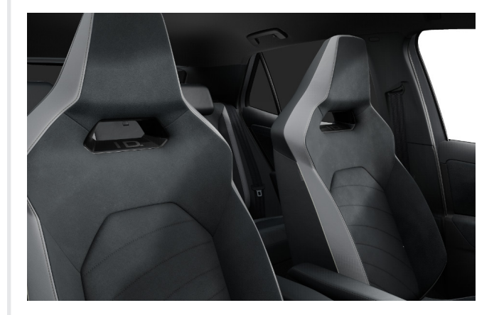
Artvelour Seats - Top sports seats Soul-Artvelour eco Option on ID.3 Pro & Pro S with Interior Plus Package