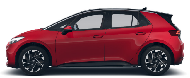
King's Red Metallic**