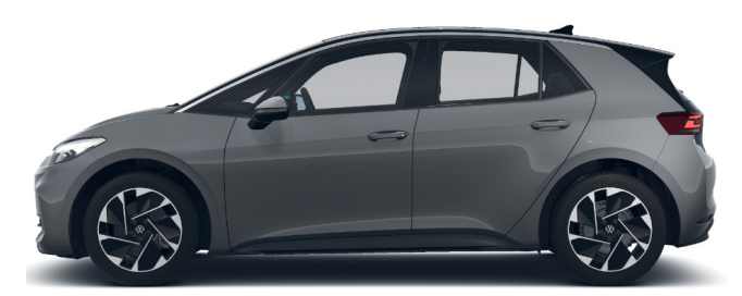
Moonstone Grey Solid