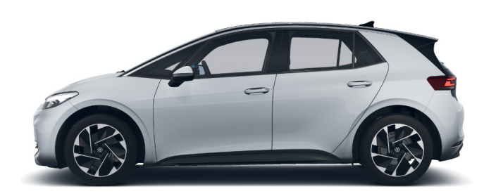
Scale Silver Metallic**