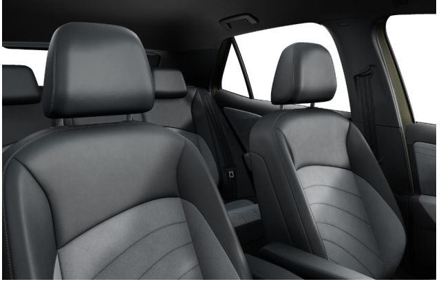
Artvelour Seats Dusty Grey/Dark Soul Black Standard on ID.3 Pro S - option on Pro with Interior Package