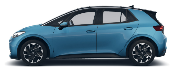
Costa Azul Metallic**