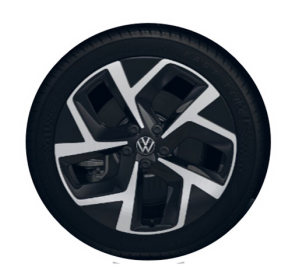
STANDARD ON ID.3 PRO S 19" 'Wellington' alloy wheels 7.5J x 19 Tyres: 215/50 R19