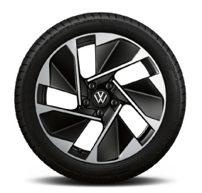
STANDARD ON ID.3 Pro Plus 18" 'East Derry' alloy wheels 7.5J x 18 Tyres: 215/55 R18