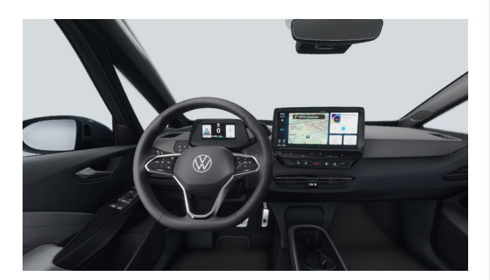
Standard on ID.3 Pro S Dusty Grey Dark stitching Crystalgrey