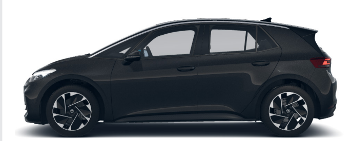
Mythos Black Metallic**