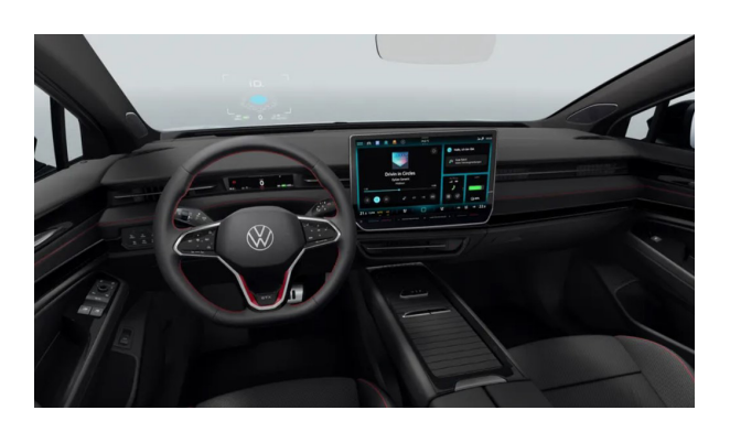
Soul Black - Red (ZQ) Standard from ID.7 GTX PLUS

Note: The print processes do not allow exact reproduction of the upholstery & insert colours.