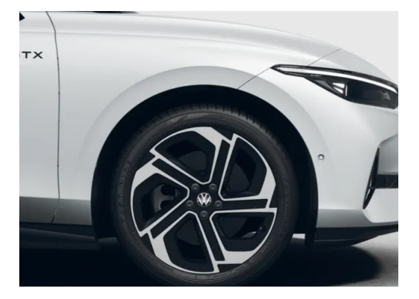
STANDARD ON ID.7 GTX PLUS 20" "Skagen" alloy wheels 8.5 J x 20 front, 9.5 J x 20 rear, in black, high-sheen surface, Airstop Tyres