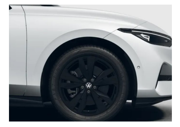
OPTIONAL ON ID.7 PRO PLUS / PRO S PLUS (WBS) 19" "Bergen" alloy wheels 8 J x 19 / 8.5 J x 19, in black