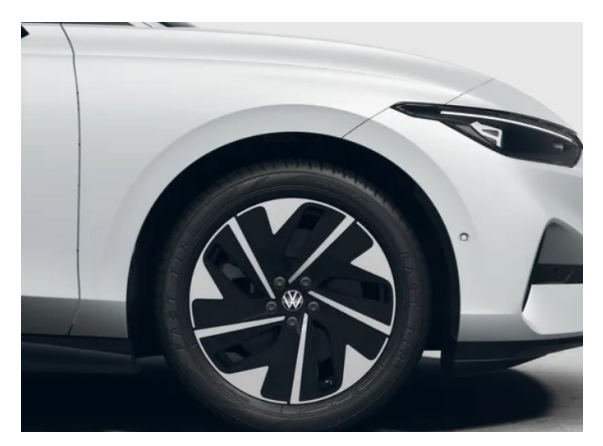
STANDARD ON ID.7 PRO PLUS / PRO S PLUS 19" "Hudson" alloy wheels 8 J x 19 / 8.5 J x 19, in black/high-sheen