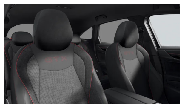
Inserts of front seats and outer rear seats in perforated ArtVelours ECO microfleece, seat bolsters in Artex (GTX) Soul Black - Red (ZQ) Standard from ID.7 GTX PLUS

Inserts of front seats and outer rear seats in perforated ArtVelours ECO microfleece, seat bolsters in Artex Mistral / Soul Black / White Steering Wheel (AK) (forces option package PBF) Optional from ID.7 PRO PLUS / PRO S PLUS