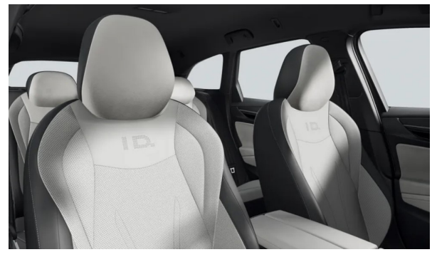
Inserts of front seats and outer rear seats in perforated ArtVelours ECO microfleece, seat bolsters in Artex Mistral / Soul Black (ZP) (forces option package PBF) Optional from ID.7 PRO PLUS / PRO S PLUS