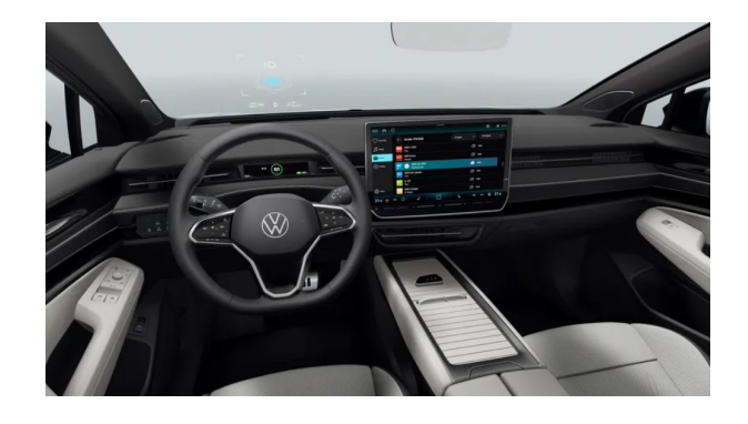
Mistral / Soul Black (ZP) Optional from ID.7 PRO PLUS / PRO S PLUS (forces option package PBF)