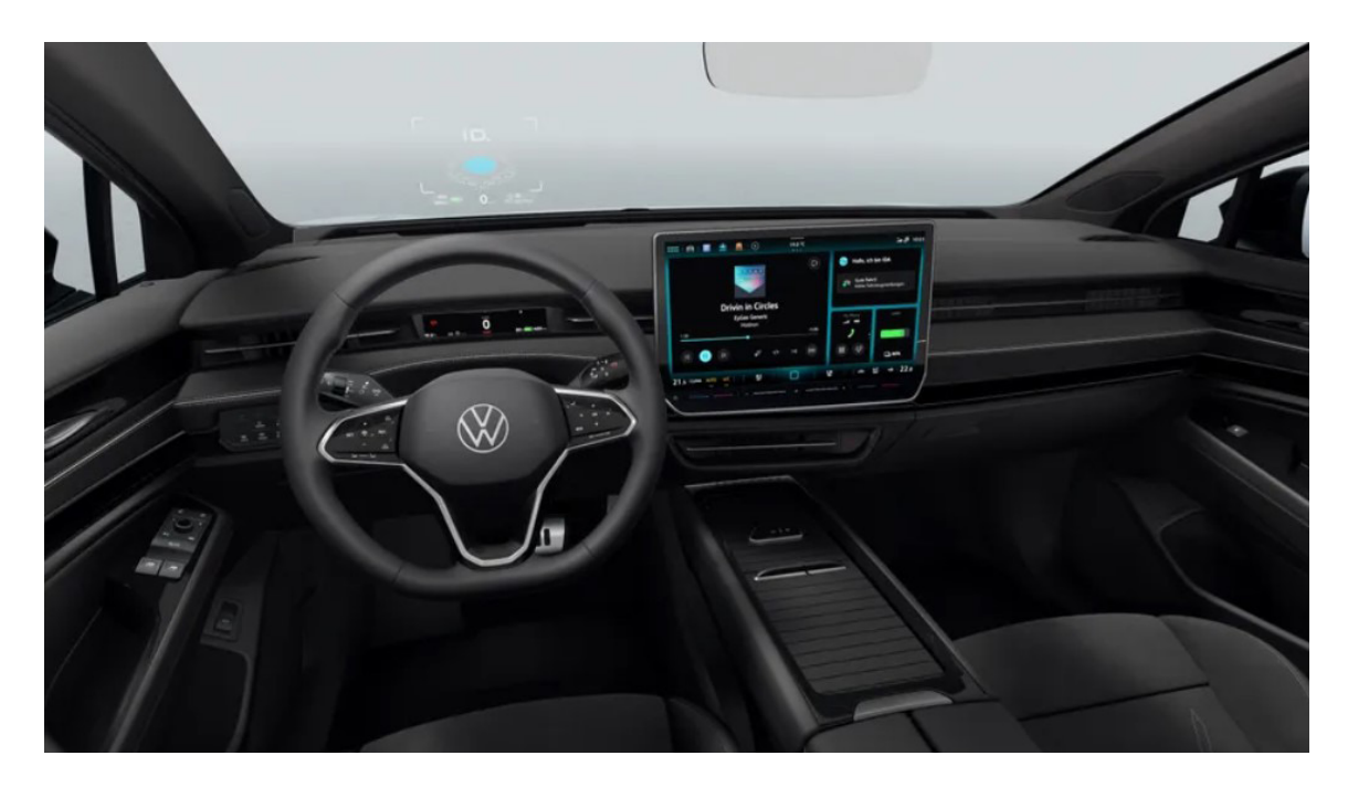
Soul Black (ZN) Standard from ID.7 PRO PLUS / PRO S PLUS