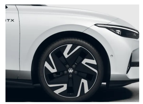
OPTIONAL ON ID.7 GTX PLUS (PJ6) 21" "Mataró" alloy wheels 8.5 J x 21 / 9.5 J x 21, in black high-sheen, Volkswagen R

For exact options prices for your vehicle, please contact your local dealer or visit www.volkswagen.ie Standard o Optional - Not available