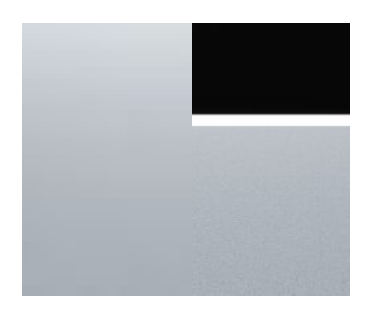
Scale Silver Metallic 1T1T / 1TA1

*Black Roof (**A1) forces P25 Exterior Plus Package including Smart Glass Roof or Black Style Package (WBS) Please note, the print processes do not allow exact reproduction of the paint colours.