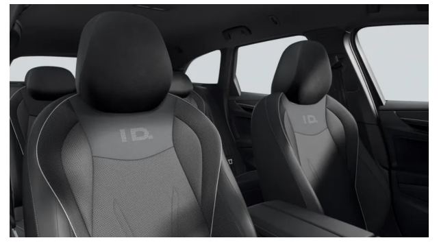
Inserts of front seats and outer rear seats in perforated ArtVelours ECO microfleece, seat bolsters in Artex Soul Black (ZO) (forces option package PBF) Optional from ID.7 PRO PLUS / PRO S PLUS

Inserts of front seats and outer rear seats in ArtVelours ECO microfleece, seat bolsters in Artex Soul Black (ZN) Standard from ID.7 PRO PLUS / PRO S PLUS