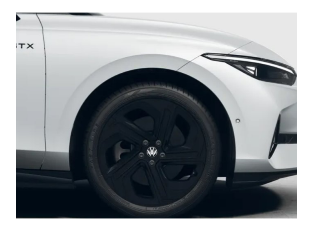
OPTIONAL ON ID.7 GTX PLUS (PJ3) 20" "Skagen" alloy wheels - Black Finish. Airstop Tyres 8.5 J x 20 front, 9.5 J x 20 rear, in black, high-sheen surface, Airstop Tyres