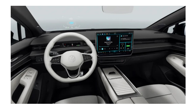
Mistral / Soul Black / Grey Detail / White Steering Wheel (AK) Optional from ID.7 PRO PLUS / PRO S PLUS (forces option package PBF)