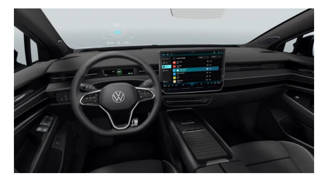
Soul Black (ZO) Optional from ID.7 PRO PLUS / PRO S PLUS (forces option package PBF)