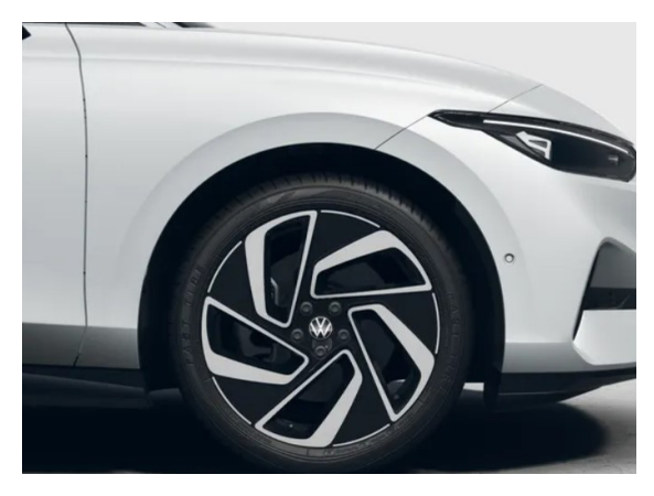
OPTIONAL ON ID.7 PRO PLUS / PRO S PLUS / GTX (PJ2) 20" "Montreal" alloy wheels 8.5 J x 20 / 9.5 J x 20, in black/high-sheen, Airstop Tyres