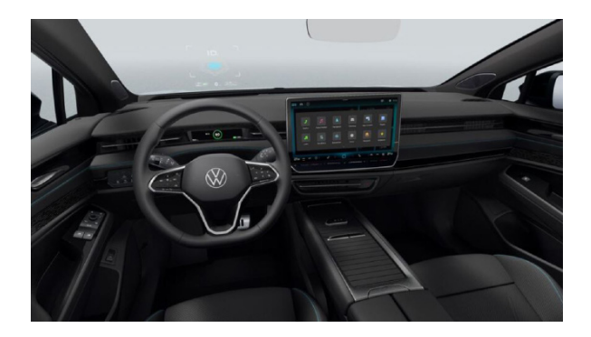
Soul Black (ZO) Optional from ID.7 PRO PLUS (forces option package PBD)