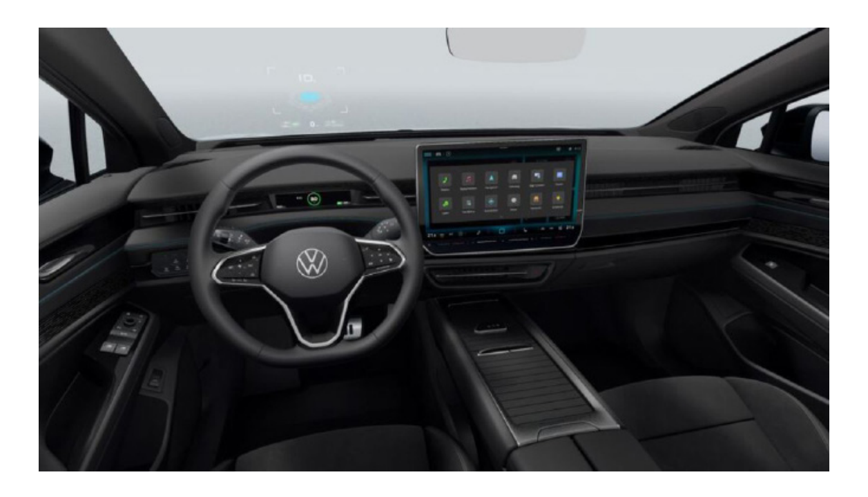
Soul Black (ZN) Standard from ID.7 PRO PLUS