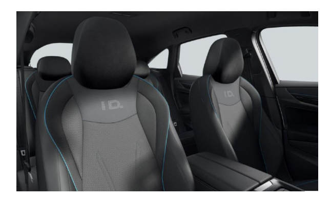
Inserts of front seats and outer rear seats in perforated ArtVelours ECO microfleece, seat bolsters in Artex Soul Black (ZO) Optional from ID.7 PRO PLUS (forces option package PBD)