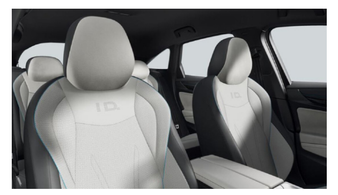
Inserts of front seats and outer rear seats in perforated ArtVelours ECO microfleece, seat bolsters in Artex Mistral / Soul Black (ZP) Optional from ID.7 PRO PLUS (forces option package PBD)