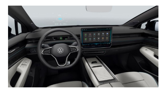
Mistral / Soul Black (ZP) Optional from ID.7 PRO PLUS (forces option package PBD)