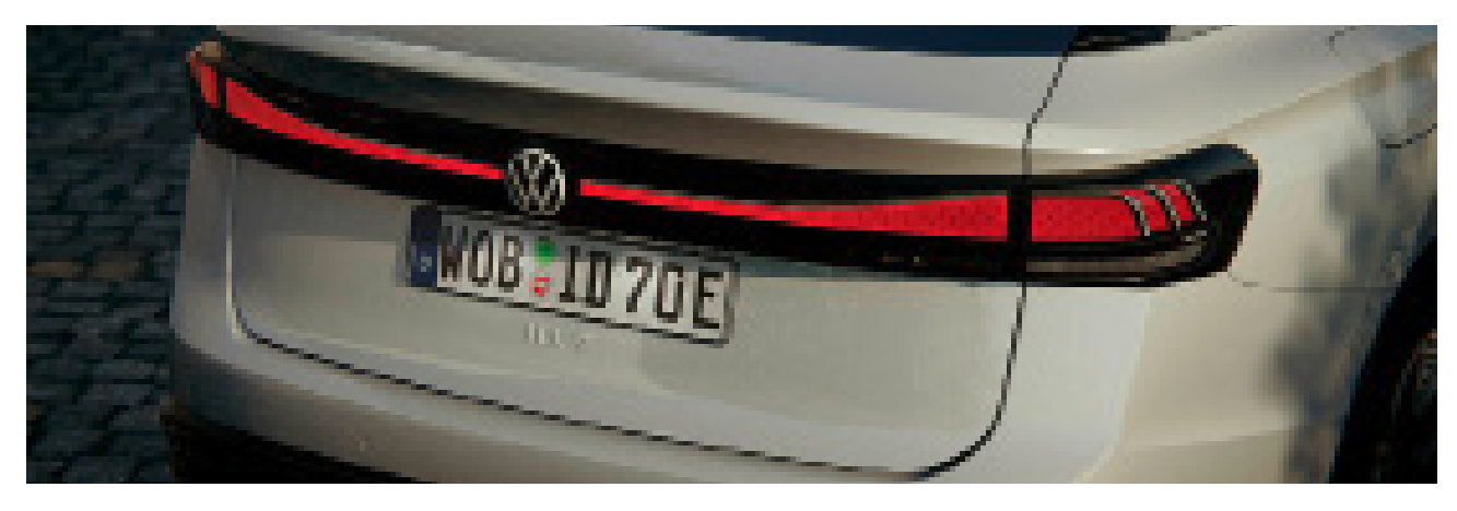
For exact options prices for your vehicle, please contact your local dealer or visit www.volkswagen.ie