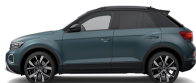
Petroleum Blue Metallic Black Roof