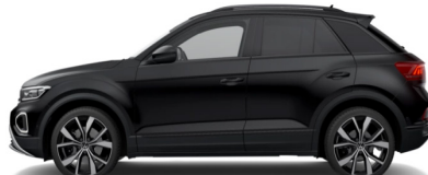
Deep Black Pearl Effect