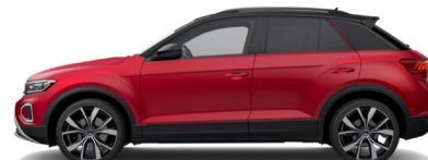
Kings Red Metallic 1 Black Roof