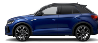
Lapiz Blue Metallic 1 Black Roof