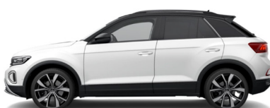
Pure White Solid Black Roof