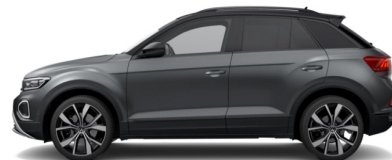
Indium Grey Metallic Black Roof