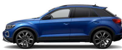
Ravenna Blue Metallic 1 Black Roof